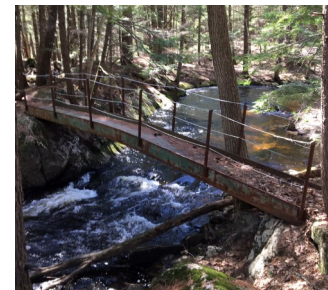
The bridge over the Lane River, Sutton