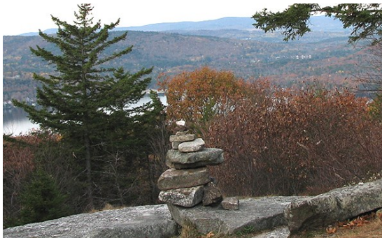
A view from the Sunset Hill Trail, Newbury

The trail is marked with blue blazes and goes into woods, over a unique iron bridge on the Lane River, and then follows a loop back to the same bridge. On the trail there are views along the river, large glacial erratics, and views across three wetlands. Total loop distance is just over 2 miles.