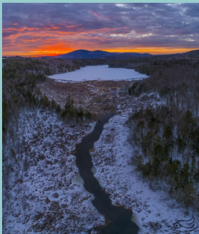
An aerial view of a sunset over Clark Pond, New London