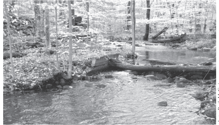
Remains of an old mill site on Sucker Brook within the Hiller easement.