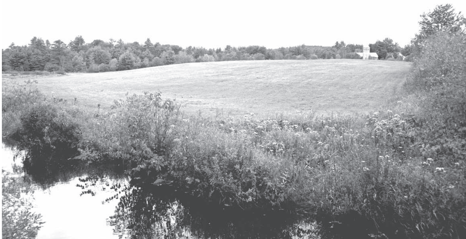
Battles Farm is located on Center Road in Bradford. This photo is taken from Jewett Road, looking north across Hoyt Brook. The proposed conservation easement of 143 acres includes farmland, woodland and nearly one mile of frontage on Hoyt Brook.