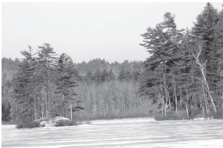
The conserved shoreline of the Messer Pond conservation easement can be seen behind and to the right of the small island.