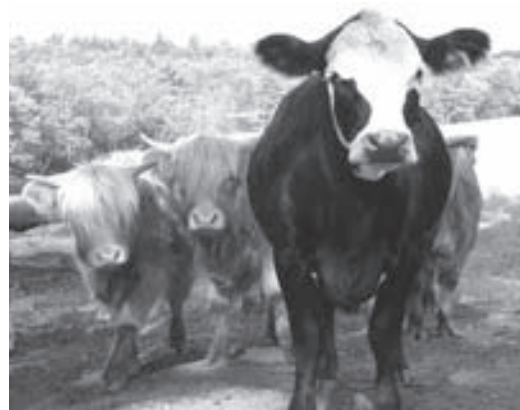
Above are some of the pasture raised beef on Star Lake Farm in Springfield, NH. Raised in a humane and sustainable manner with plenty of open pasture. No growth hormones or artificial supplements are used.