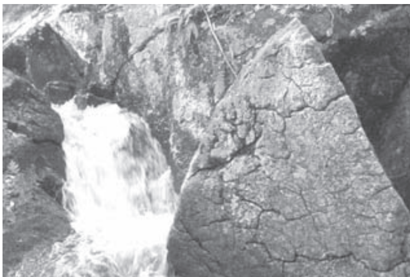
Meg Fearnley's land includes part of a Hoyt Brook tributary, which features wetlands, a beaver pond and several tumbling scenic waterfalls.