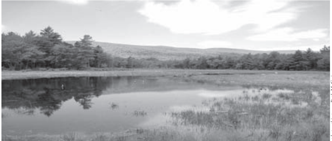
In addition to their interests in forestry and agriculture, Brooks and Janet also value the natural cycles of the beaver-created wetland area which is an open water pond when the beaver are active, and a lush green meadow when the beaver abandon their dam.

We are very glad to be able to help ensure that this land and its soils will remain intact, available for forestry and/or agriculture as future generations see fit. Its proximity to several thousand acres of protected land will help to ensure