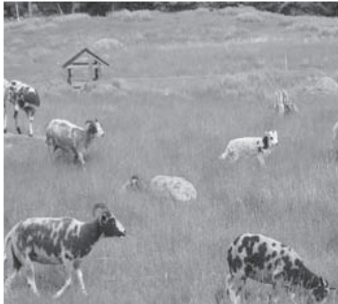
Brooks and Janet raise Jacobs sheep, a small multi-horned heritage breed, producing fiber and meat from their pastures.

suitable habitat for a diversity of wildlife through changing times.