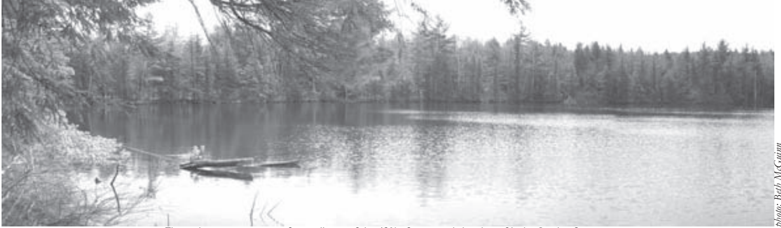
This is the panoramic view of a small part of the 42% of conserved shoreline of Ledge Pond in Sunapee. There is a public hiking trail that starts at the parking area at the end of Meadow Brook Road.