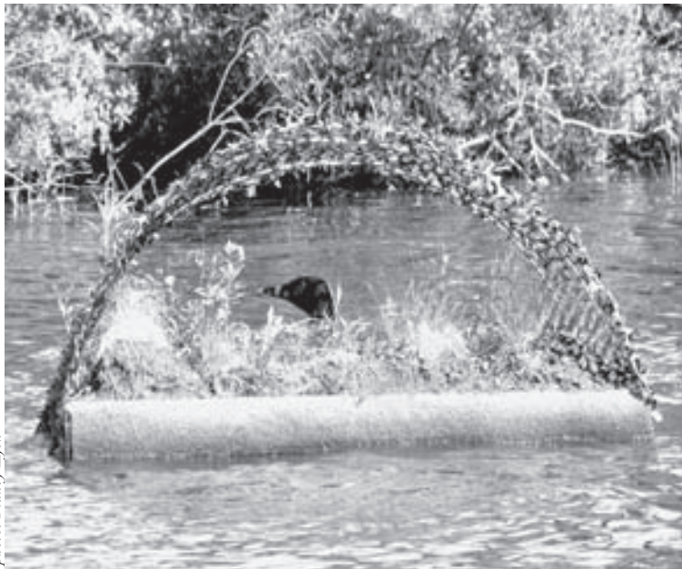
A pair of loons are nesting on this man-made floating platform on Little Lake Sunapee this summer. This nesting platform floats in a cove along three quarters of a mile of shoreline protected by 5 Ausbon Sargent properties.