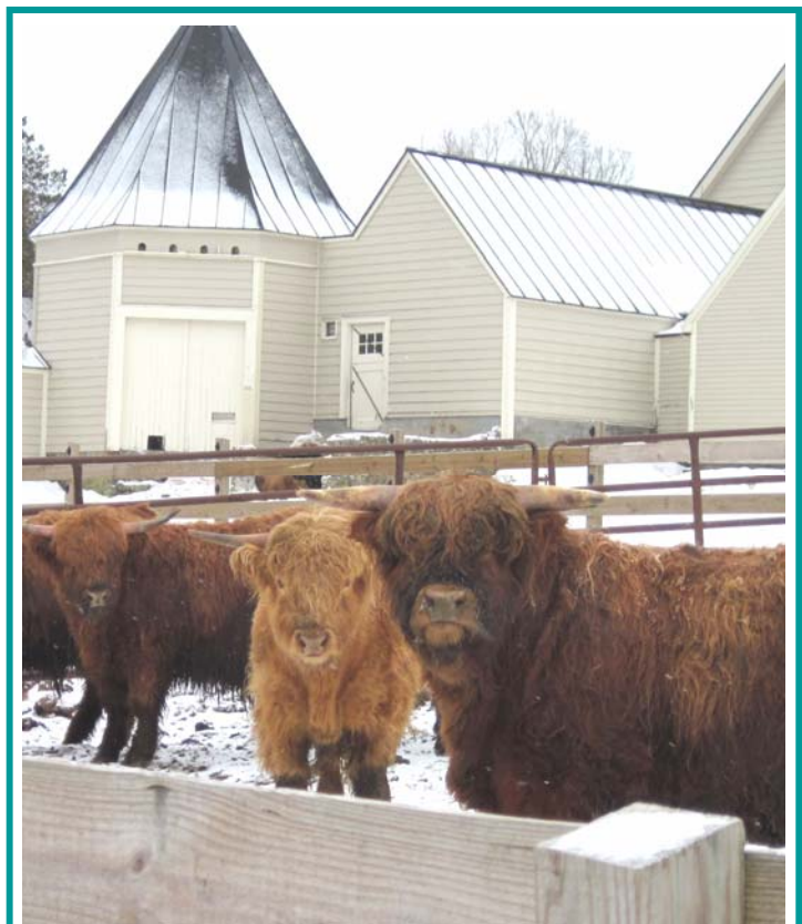
Pasture raised beef on Star Lake Farm in Springfield, NH. Raised in a humane and sustainable manner with plenty of open pasture. No growth hormones or artificial supplements are used. No chemicals or water are added to the meat during packing. Sold at another Ausbon Sargent property: www.springledgefarm.com

If you would enjoy knowing more about the history of Star Lake Farm click here to read the article from Spring 2009 in Soo Nipi Magazine at www.soonipi.com .